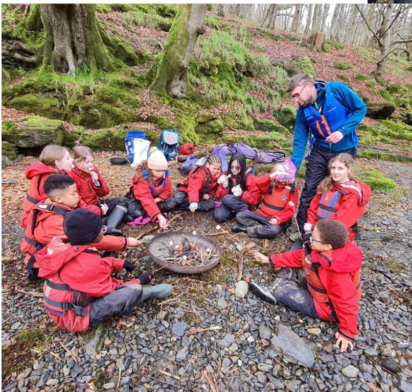
Group D burning their marshmallows