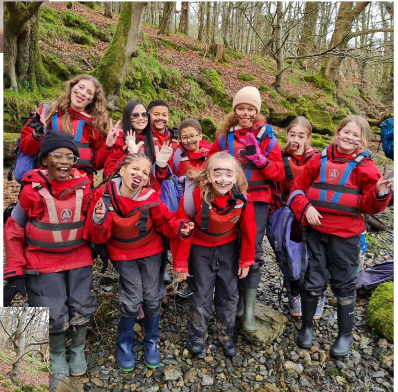
Group D being their usual selves