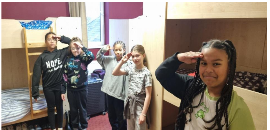
The children saluting us (as they should!) ready for their dorm inspection