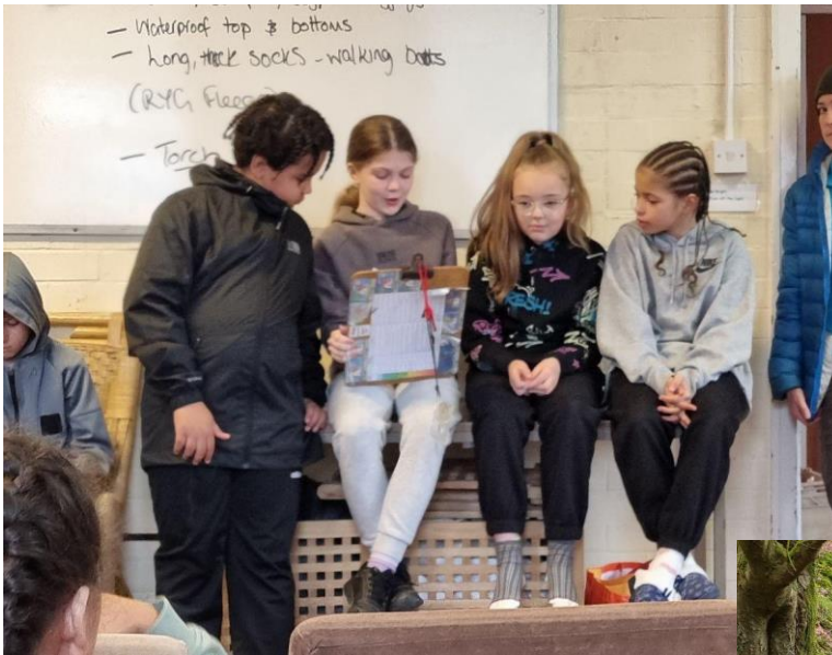
Our very helpful weather reporters briefing us